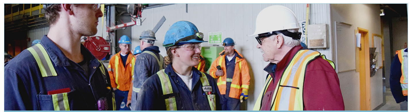
Goal 2: Assist apprentices to connect with employment opportunities and deliver the supports they need to achieve certification.