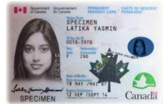
Permanent Resident Card