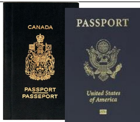
Passport (Canada or foreign)