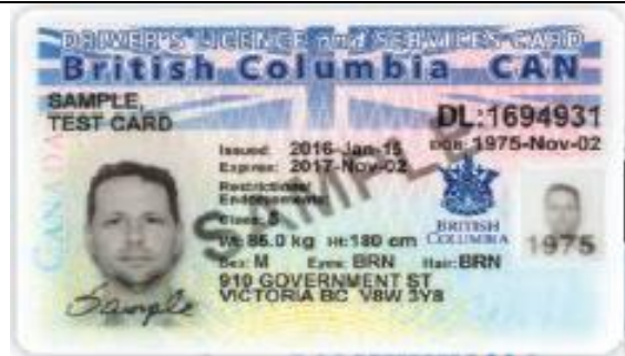
Combination Driver's License and BC Services Card