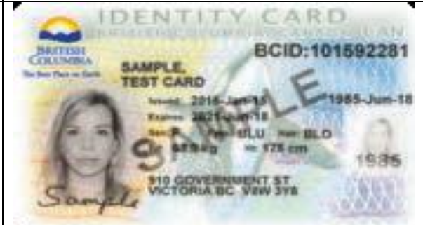
Provincial Identification Cards (BC ID Card)