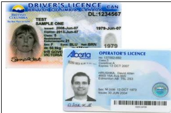
Provincial Driver's Licence (BC & Alberta shown)