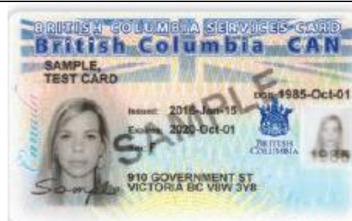
BC Services Card