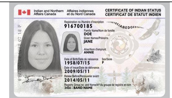
Secure Indian Status Card